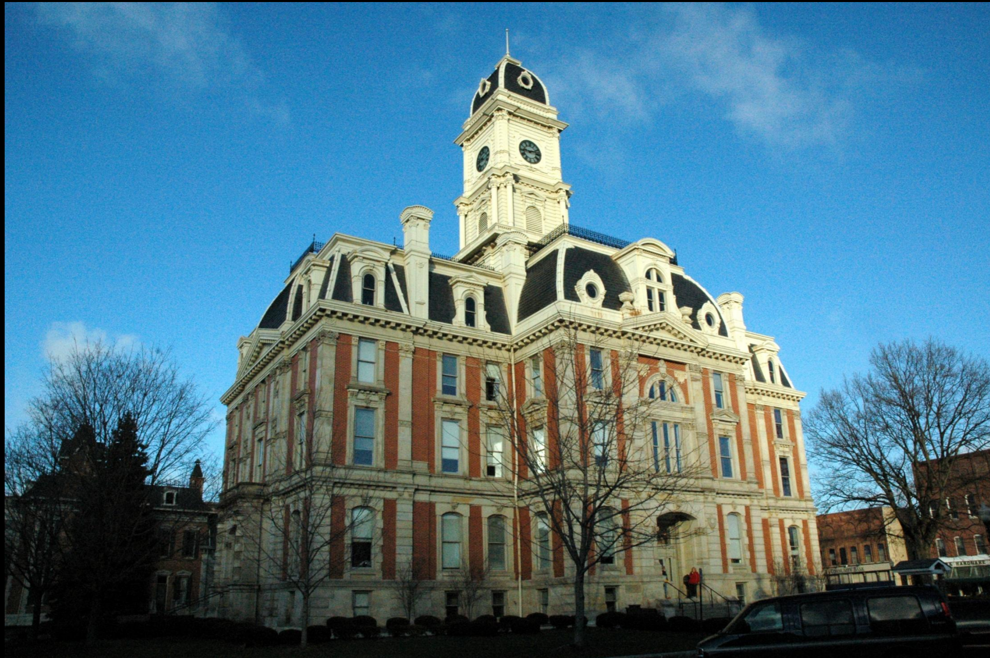
Bartholomew County Courthouse