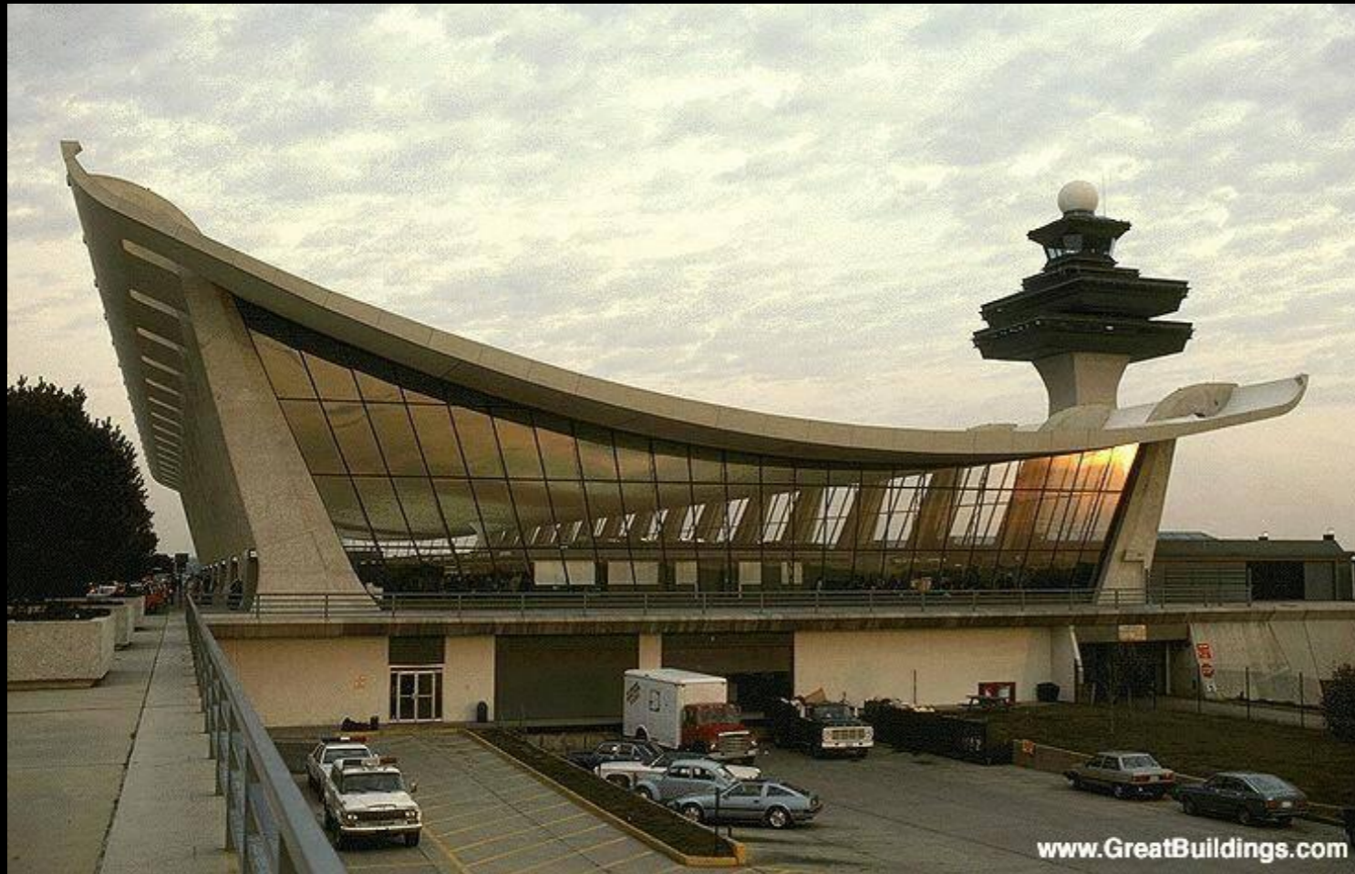
Dulles Airport Terminal 1958-1962