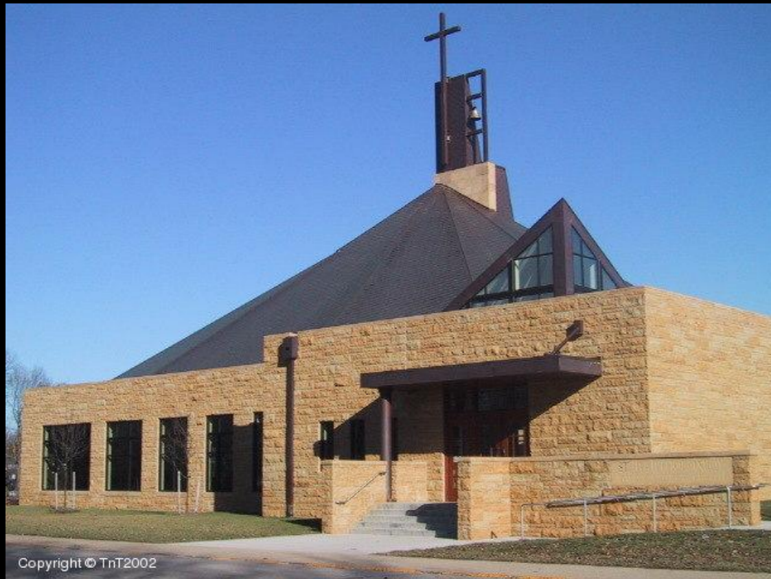
Saint Bartholomew's Catholic Church Ratio Architects 2001