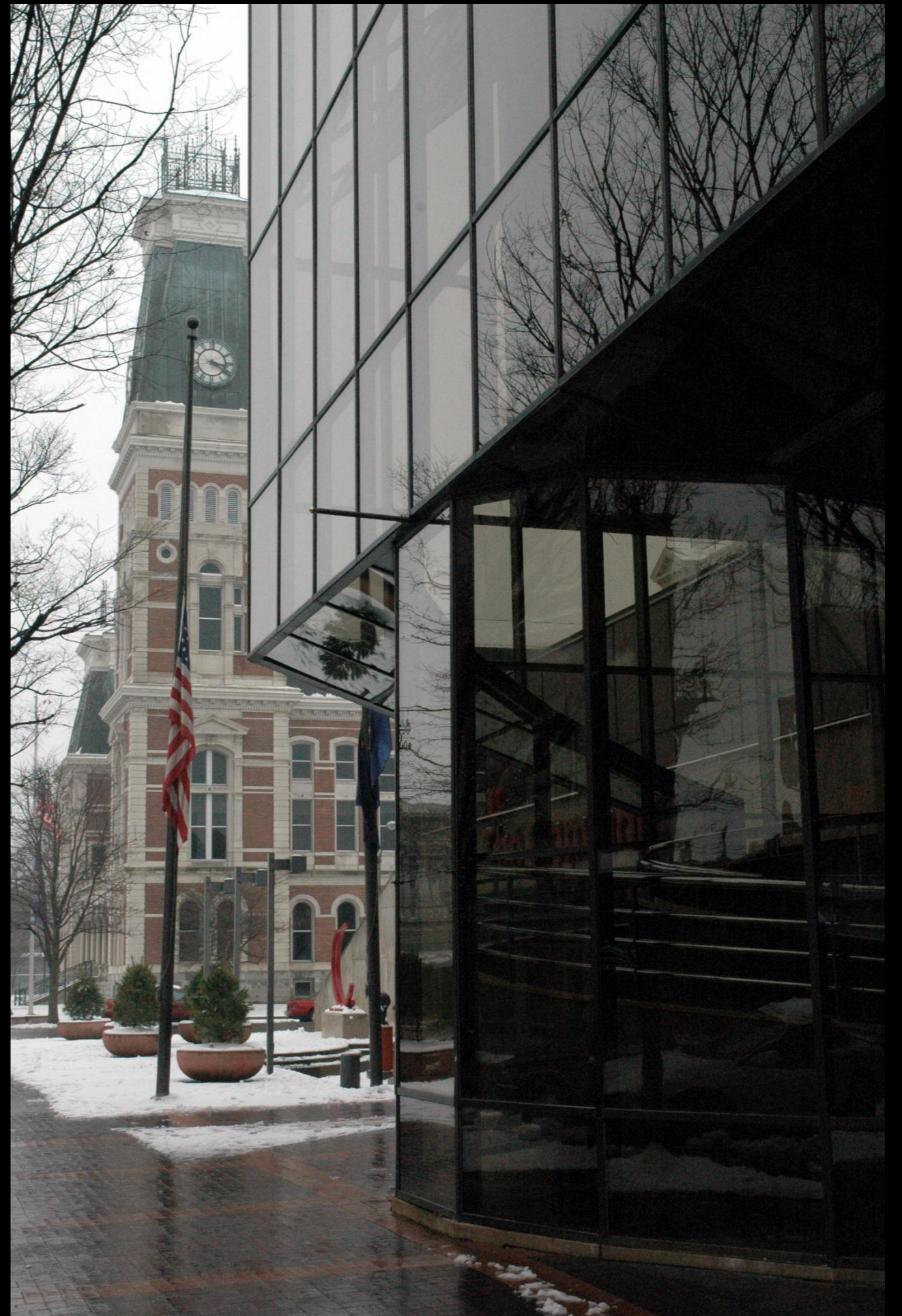
Bartholomew County Courthouse Isaac Hodgson 1874