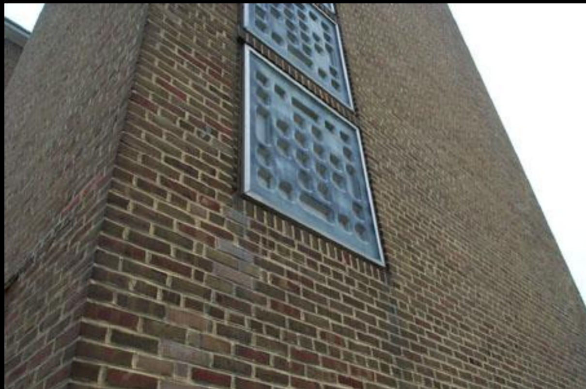
Eliel Saarinen First Christian Church Columbus, IN 1942