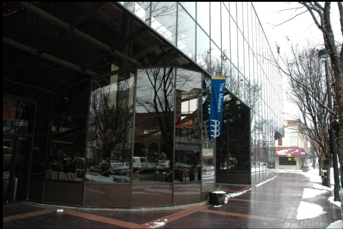
The Commons Mall Cesar Pelli 1973