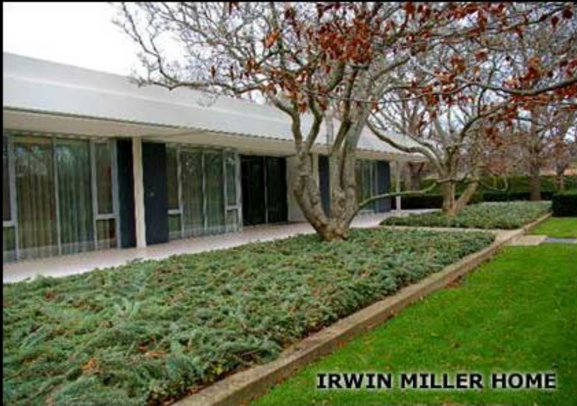
Irwin Miller Home