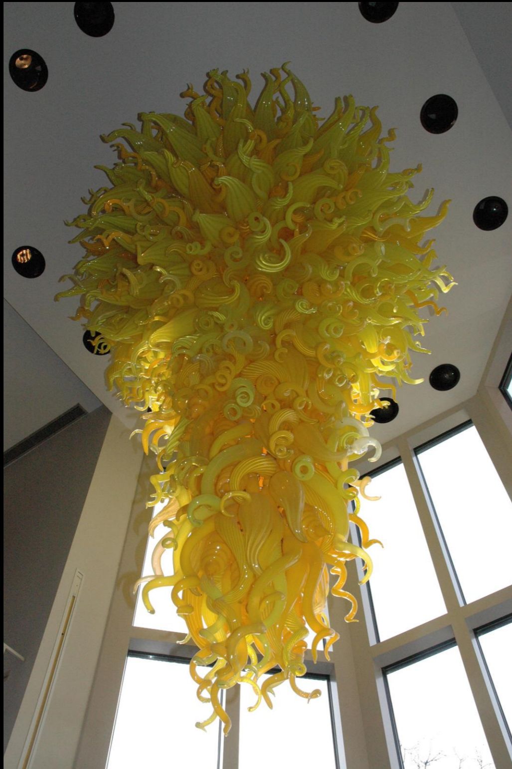
Blown Glass Sculpture