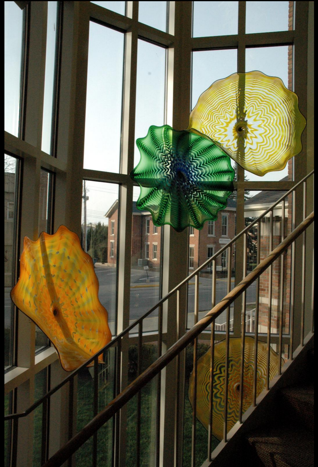
Dale Chihuly, Artist