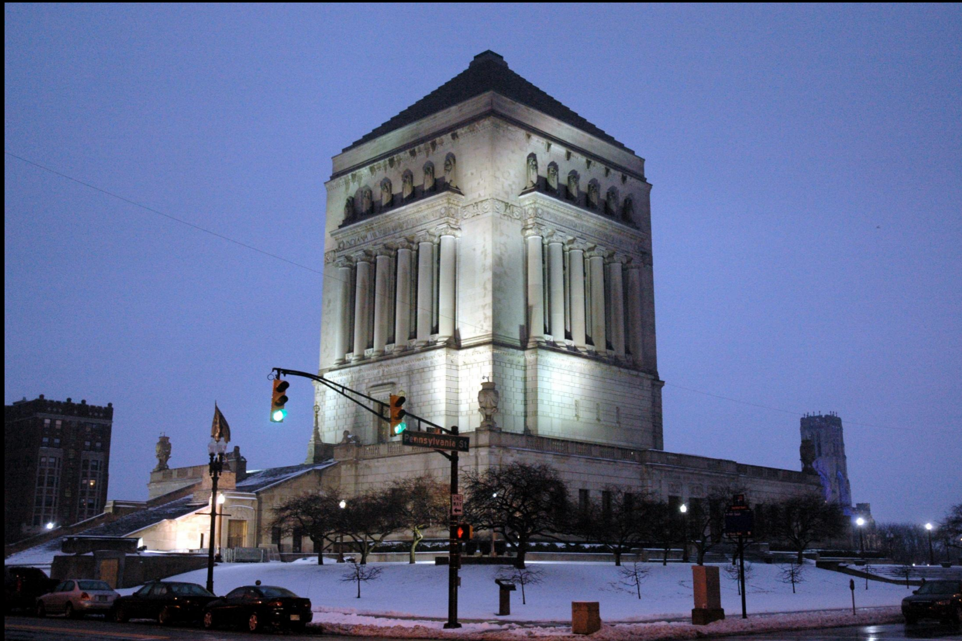
Indiana War Memorial